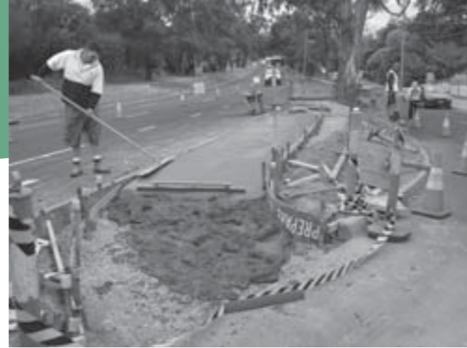
Roads and footpaths receive funding of $995,000 for upgrades and reconstruction, including bus shelters, carparks and specific funding of $380,000 for the reconstruction of William Street, Ringwood.

We enjoy sporting reserves, community buildings, attractive streetscapes, reserves and open spaces for passive and active use. Roads, drains and footpaths are also a major component of our capital works program.