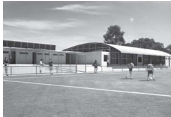
$1.5 million will be spent on recreational improvements to sporting ovals and reserves, including the resurfacing of netball courts at Cheong Park and a shade shelter at the athletics track at Town Park, as well as $240,000 to install a new synthetic pitch at Ringwood soccer ground.