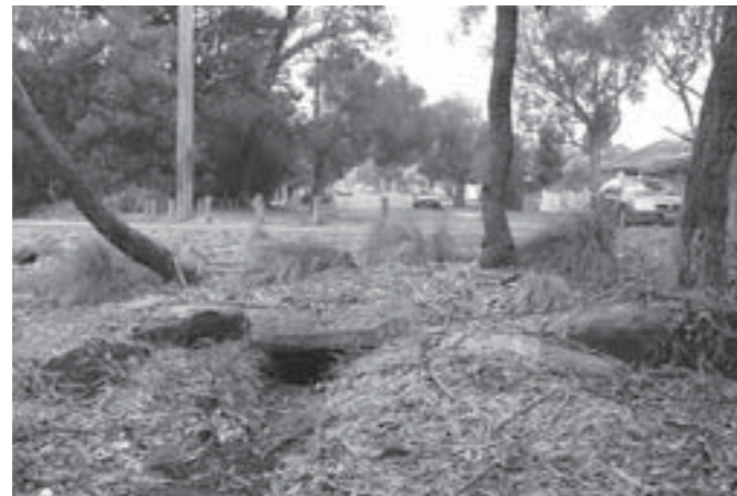
An extensive system of stormwater drains exist throughout Maroondah requiring monitoring, maintenance and renewal. Council's program for this year will see upgrade works for Georges Road stormwater and the second stage of Bridget Court works as part of the total drainage budget of $760,000.