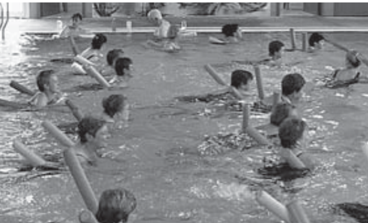
$3.6 million funding for building improvements including capital improvements to sporting and community group facilities on Council land managed by others and access upgrades. $385,000 will be spent on upgrades to the Ringwood Aquatic Centre and $187,000 for improvements to the Karralyka Theatre.