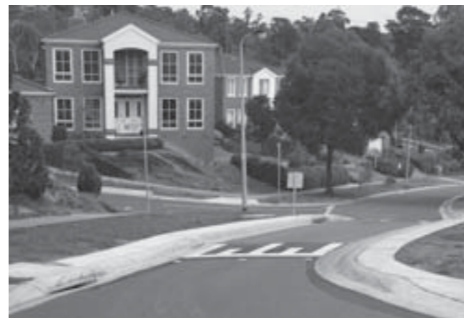
Traffic through Barnsdale Way will be calmed with the installation of slow points from the $320,000 budgeted for local area traffic management. Intersection treatments, roundabouts, traffic calming and raised pavements are used to make our local roads safer for all users.