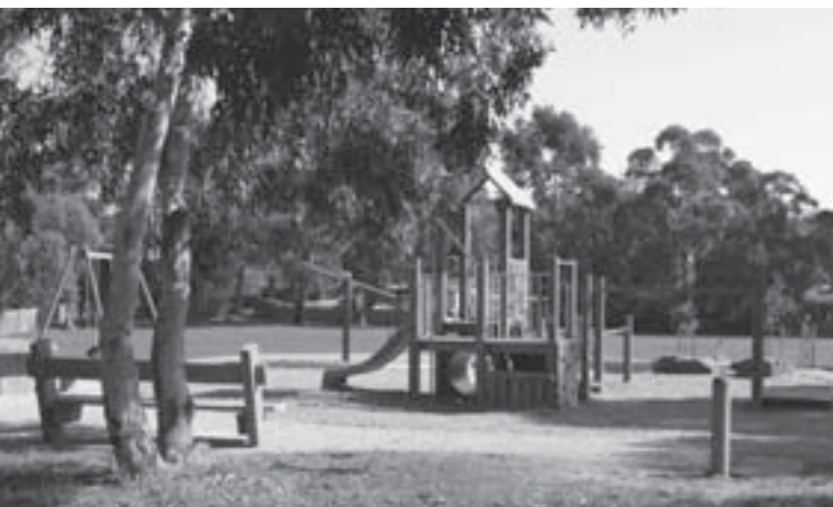
Playgrounds at Quambee and Lockhart Road Reserves will benefit from the $120,000 allocated to upgrade and renew playground equipment, similar to Brentwood Park, as part of Council's commitment to upgrading recreational areas, including paths, furniture and shade structures.