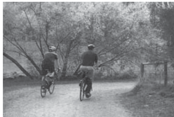
Major works will be undertaken throughout Maroondah as part of the ongoing Road Asset Enhancement program, with $2.6 million allocated. Works will include upgrades to bicycle and shared pathways, as well as new asphalt overlays in Holloway Road, Great Ryrie Road and Eastfield Road.